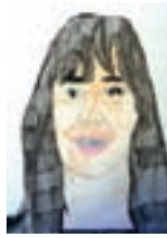
Rachel Hook (Portrait of Mandi, coloured pencil, 2011)