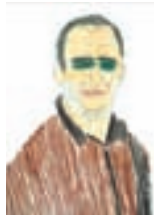
Kubus Joss (Portrait of Stuart, coloured pencil, 2011)