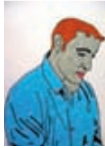
Scott Cation (Portrait of Alister, felt tip pen, 2011)