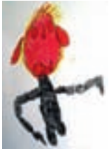
Fiona Birrell (Portrait of Shona, pen, 2011)